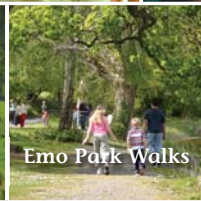
Emo Park Walks