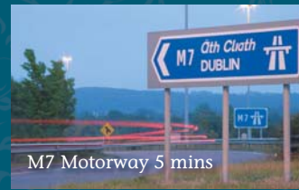
M7 Motorway 5 mins