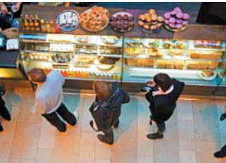
Local Leisure Centres

and Kilkenny. With the Monasterevin and Kildare bypass complete, Abbeylix becomes the first town on the N8 to Cork bringing Dublin within 1 hours drive. The homes on this exclusive estate will be finished to the highest specifications with natural slate, brick plinths, cobble-lock walkways and a build quality which is the hallmark of A Grealy Homes Development.