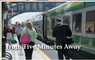
Train Five Minutes Away