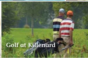
Golf at Killenard