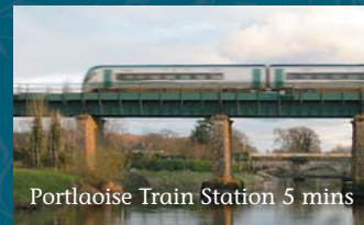
Portlaoise Train Station 5 mins